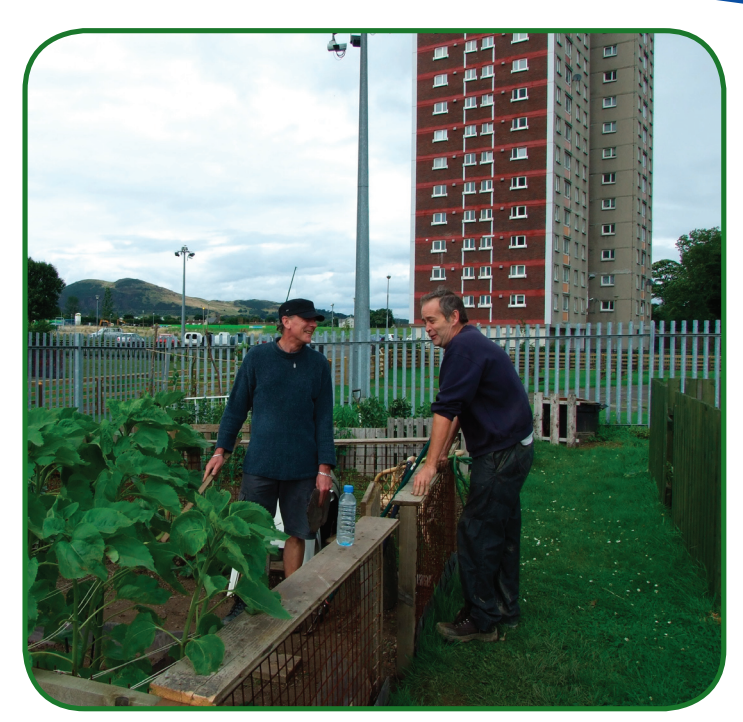
Greendykes Organic Allotment project

involvement as project partners means that they directly inform and influence their management and development. Tenants have direct ownership of their local greenspace through managing their own plots.