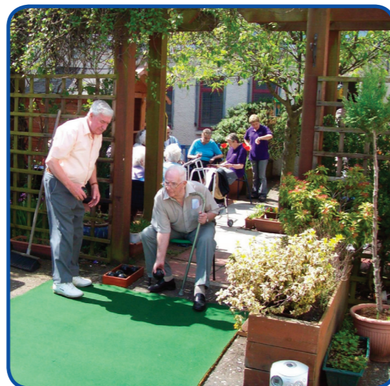
One of many activities offered by the Centre

Regular classes are run from the premises in Art, Local History and Basic Computing and Internet. Our little cyber café offers access to the internet which further addresses isolation and offers e-mail contact with physically distant family and friends.