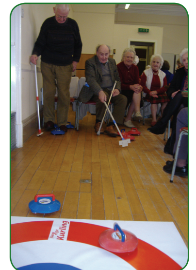
Indoor Kurling at the Lunch Club

Team members have benefited in so many ways from being involved with the project. They have improved their skills, knowledge and capacity by attending courses and implementing what they have learned to improve their communities. They have also made great gains in confidence and pride including presenting to key Government Ministers. This initiative, jointly funded by Health and Local Authority, has raised awareness of potential fall risks, increased exercise opportunities for frailer older people and is now exploring barriers to mental health and wellbeing in later life. Team members have been inspired to spread the original topic and are constantly identifying new ideas resulting in impressive results. The lifeblood of concerned communities is committed local people and this project has revitalised those who take part with a sense of achievement and worth and, in some cases, revolutionising their outlook on life.