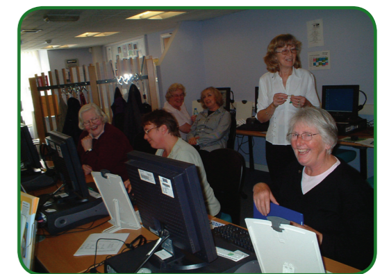
Skilling-up for community engagement – Perth and Kinross Healthy Communities Collaborative (see page 3 for more details)