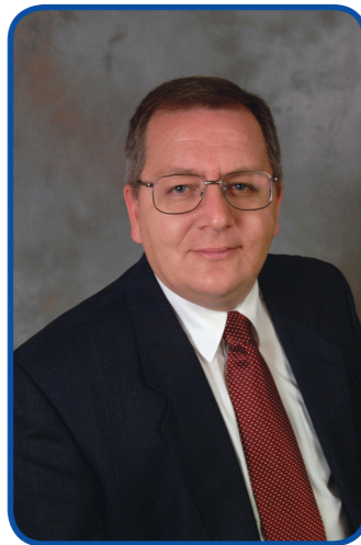
Brian McKechnie Senior Studies Institute

There is lots of evidence from research into health during retirement that people who retire early live shorter, less healthy lives than those retiring at 65 or later. Many people find this surprising, supposing that not having to work daily means that their lives will be less stressful and, consequently, more enjoyable. However, having a purposeful and active lifestyle in later life will positively and significantly impact on an individual's health, overall quality of life and longevity.