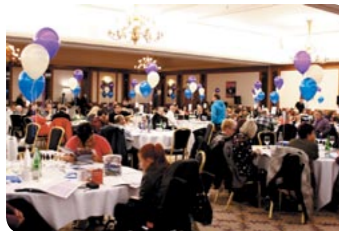
Participants at a recent GDA event.

Crucially, GDA is good at recognising interest, and is always looking for what people want to do and helping them arrange it. Helping people to define their own outcomes – individually and collectively – is crucial along with putting access and support in place so that goals can be pursued.